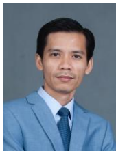
SIENG Deline Partner

D +855 23 963 112 / 113 F +855 23 963 116 hout.sotheary@rajahtann.com