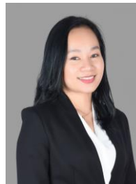
PROM Savada Partner

T +855 23 963 112 / 113 F +855 23 963 116 heng.chhay@rajahtann.com