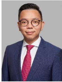
TIV Sophonnora Partner

T +855 23 963 112 / 113 F +855 23 963 116 hout.sotheary@rajahtann.com